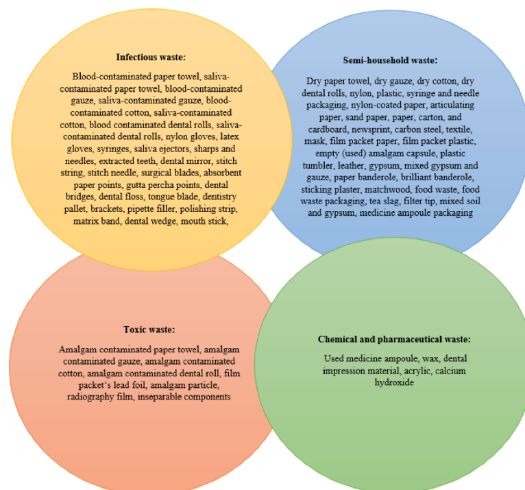
Fig. 2. Categorization of types of dental wastes in Iran 1, 3-6