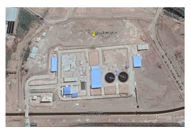
Figure 1. Geographical location of Saveh WTP