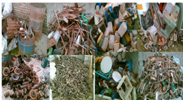
Fig. 2. Types of waste disassembled at recycling workshops

According to the evaluation of the MSW in the Indian capital, New Delhi, 17% of waste was shipped to recycling units, which could enhance employment in the community with proper organization. 14 In the management of waste recycling, in addition to the quantity and quality of plastic waste, the overall sustainability of the whole recycling chain should be evaluated before the start of operations. The recycling chain is optimized and can bring environmental and economic benefits to the community and those involved in this work. 21