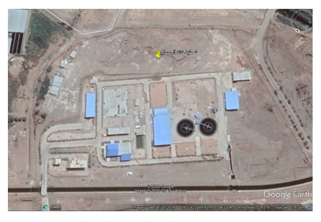
Figure 1. Geographical location of Saveh WTP

In this study, FeCl<sub>3</sub>.6H<sub>2</sub>O was used as the coagulant, manufactured in Iran. The coagulant stock solution was prepared by dissolving 1.6615 g of ferric chloride in 1 L of distilled water. To adjust pH, hydrochloric acid and 0.1 N sodium hydroxide were employed.